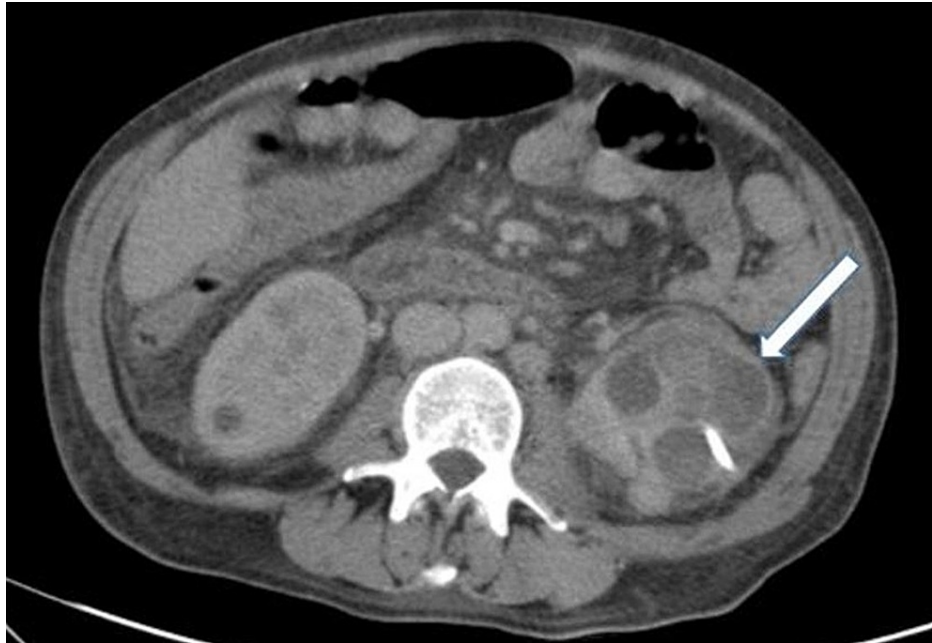
FIGURE 2: Abdominopelvic CT scan showing the reduction in the right abscess and significant increase on the left, with the presence of new abscesses (white arrow)