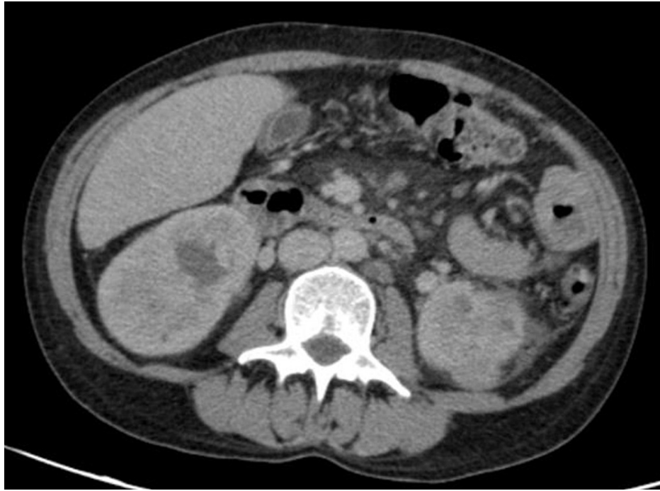
FIGURE 3: Abdominopelvic CT scan showing no renal abscess recurrence