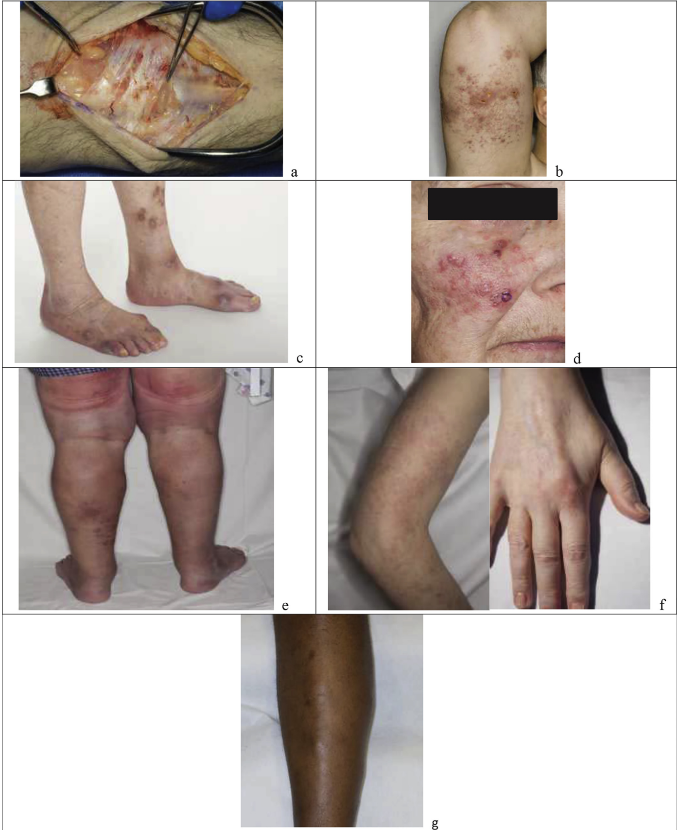
Fig. 1. M. haemophilum clinical presentations.