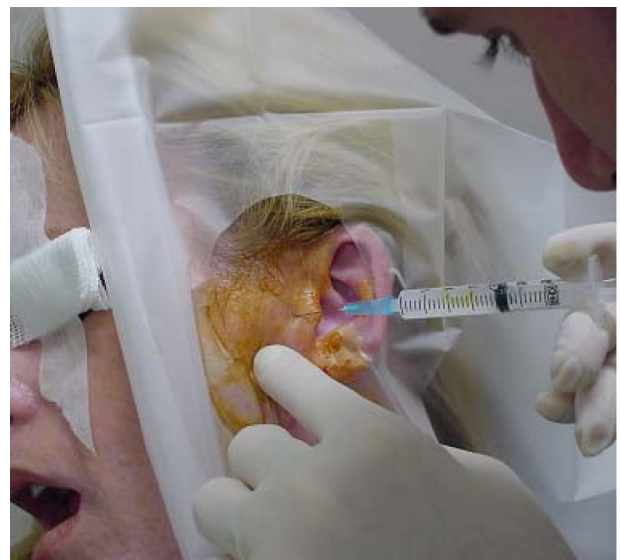
Figure 2 Temporomandibular joint injection.

Tricyclic antidepressants like amitriptyline and nortriptyline may be used for more chronic MFP. 21,31 In addition, they can be prescribed for the TMD patient who has tension-