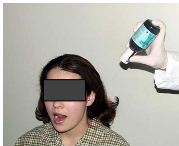
Figure 1 Jaw N-stretch with vapocoolant spray.

Medications are an effective addition in managing the symptomatology of intracapsular disorders. 1 Commonly used pharmacological agents for the treatment of TMJ disorders include analgesics, nonsteroidal anti-inflammatory drugs (NSAIDs), local anesthetics, oral and injectable corticosteroids, sodium hyaluronate injections, muscle relaxants, botulinum toxin