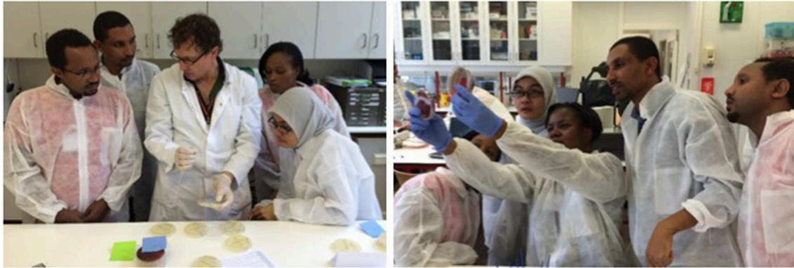
FIGURE 3 | During so-called “Plate Rounds,” clinicians and laboratory staff meet in the laboratory and discuss selected cases of infections in a didactic setting. Culture plates including AST results are shown and discussed (e.g., de-escalation of antibiotic treatment (84). Moreover, Plate Rounds can be connected to remote expert advice by telemedicine (180). Originally conceived as a training tool applied in academic medical centers, Plate Rounds provide excellent opportunities for diagnostic and antibiotic stewardship and create liaisons between clinicians and laboratory staff, trainees and in case pharmacists and IPC team (84). The pictures above are “Plate Rounds” set-up during the short course “Hospital-based Interventions to Contain Antibiotic Resistance in Low-resource Settings” at the Institute of Tropical Medicine. Participants of the microbiology track demonstrate case-based laboratory cultures to their colleagues from the antibiotic stewardship and infection prevention and control tracks (181). Written informed consent was obtained from the individuals for the publication of this image.

the national laboratory health plan (47). Such a strategy includes integrated and harmonized supervisory visits within the tiered laboratory system and mechanisms for feedback and remedial action (47).