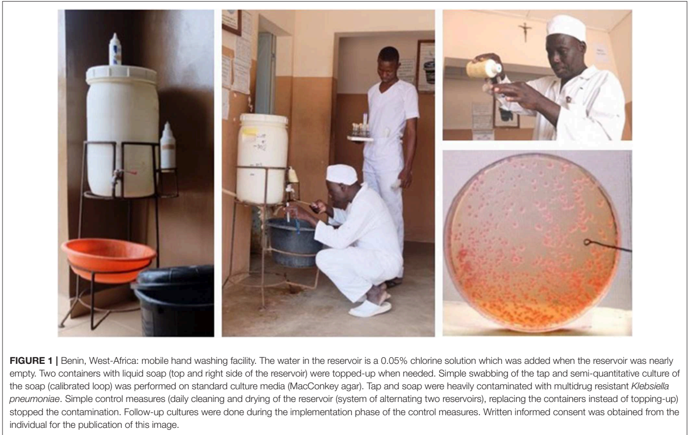
FIGURE 1 | Benin, West-Africa: mobile hand washing facility. The water in the reservoir is a 0.05% chlorine solution which was added when the reservoir was nearly empty. Two containers with liquid soap (top and right side of the reservoir) were topped-up when needed. Simple swabbing of the tap and semi-quantitative culture of the soap (calibrated loop) was performed on standard culture media (MacConkey agar). Tap and soap were heavily contaminated with multidrug resistant Klebsiella pneumoniae . Simple control measures (daily cleaning and drying of the reservoir (system of alternating two reservoirs), replacing the containers instead of topping-up) stopped the contamination. Follow-up cultures were done during the implementation phase of the control measures. Written informed consent was obtained from the individual for the publication of this image.

examples of this include the European Antimicrobial Resistance Surveillance Network (51), the Central Asian and Eastern European Surveillance of Antimicrobial Resistance 6 and the Latin American Antimicrobial Resistance Surveillance Network (52). Surveillance activities have also been conducted in hospitals (secondary or tertiary level) in LRS where CBL have been installed as part of operational research and capacity building programmes (53–56) and have been frequently organized into networks 7 .