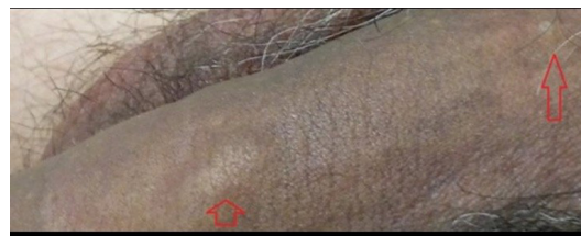
Figure 2 Arrows indicated the superficial dorsal vein thrombosis.

Mondor's disease is a thrombophlebitis of the superficial veins of the body and it was described by Enri Mondor first time in 1939. 1 Thrombosis of the superficial dorsal vein of the penis was described by Braun Falco in a patient with a generalised phlebitis in 1958. Isolated thrombosis of the dorsal superficial vein of penis was first reported by Helm and Hodge in 1958. 2 Still today, a few cases of isolated thrombophlebitis of the superficial vein of penis are reported in literature. 3 No specific aetiology has been found, and patients' age ranged between 18 and 79 years. Hypothetical causes of disease include trauma, infections, excessive sexual activity or abstinence, thrombophilia, inguinal hernia, body building exercises, pelvic cancer, pelvic venous occlusion and stasis. In the described case, the spinal stabilisation was performed with left subcostal retroperitoneal approach. During surgery, excessive compression