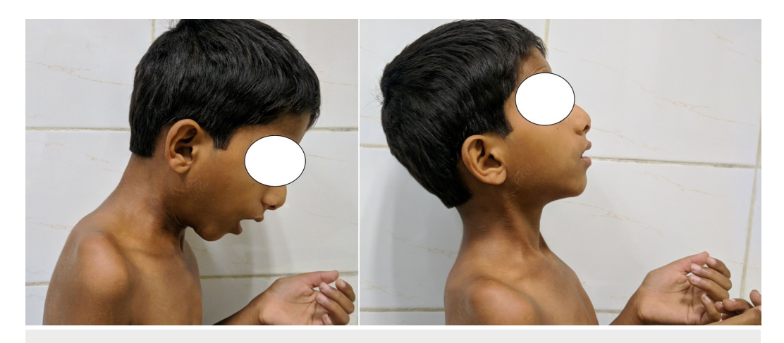
FIGURE 3: Clinical picture demonstrating restriction in neck movements.

There was severe restriction of the neck flexion and extension movements.