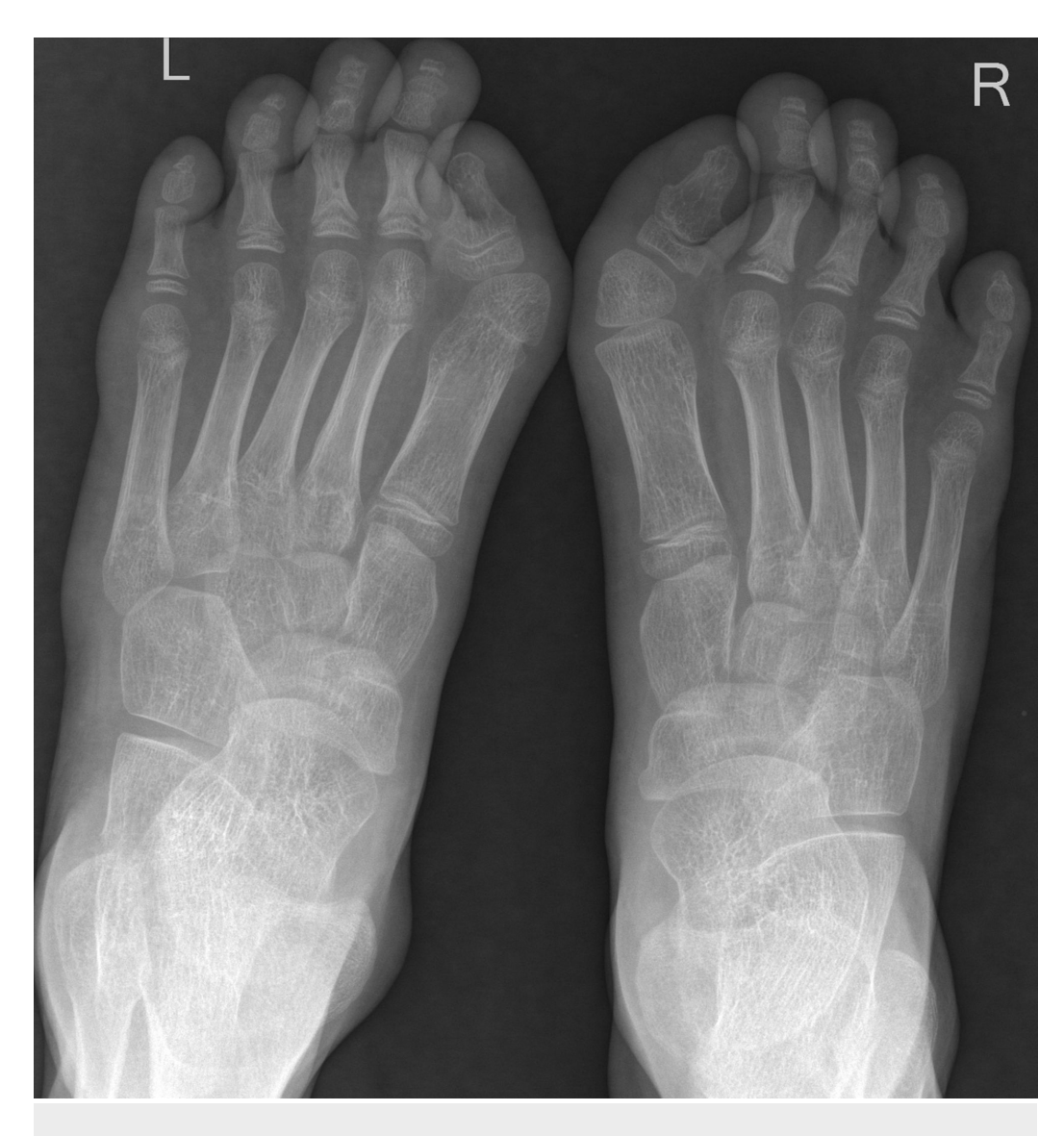
FIGURE 9: Plain radiograph of both foot – anteroposterior view.

Bilateral hallux valgus with monophalangism of the great toes.