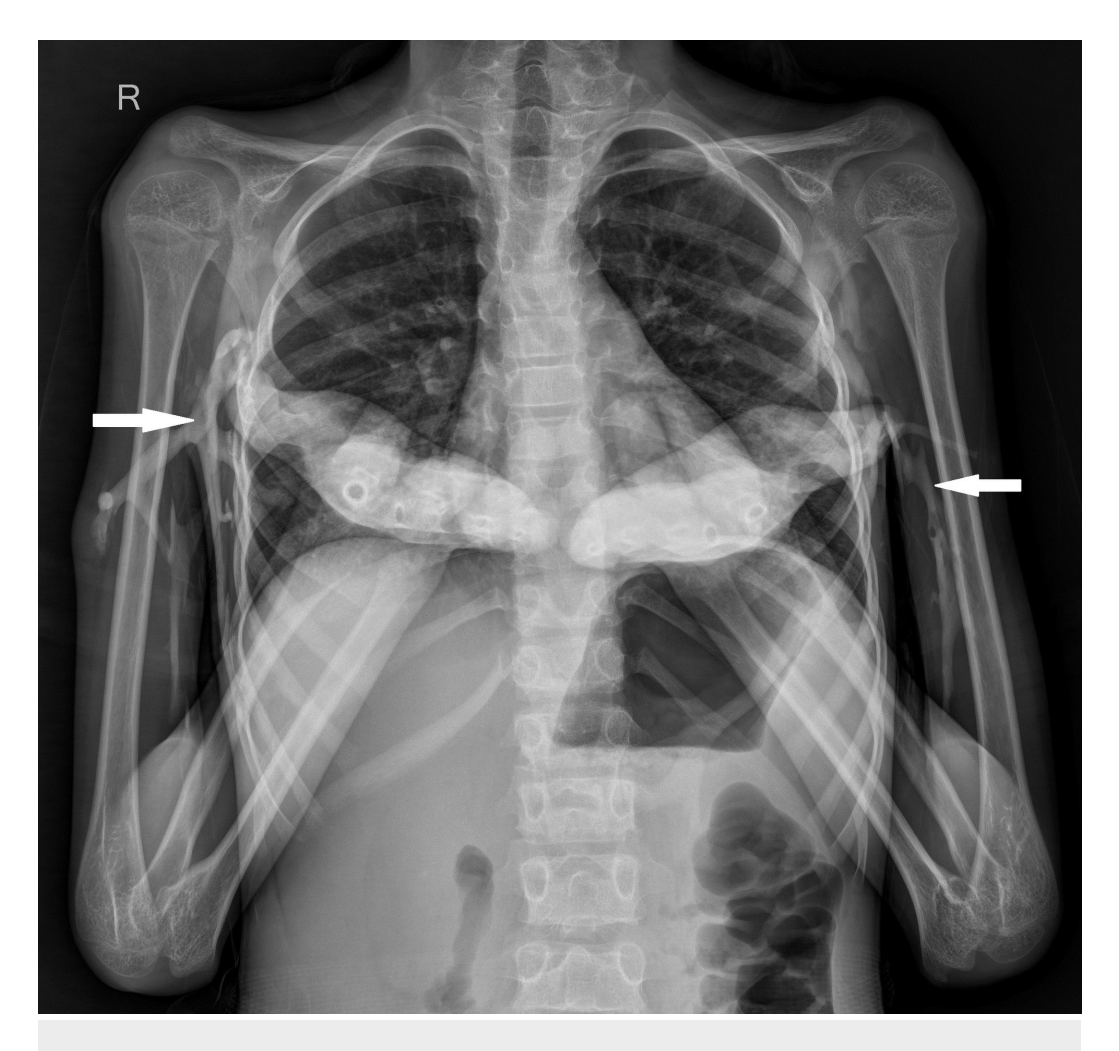
FIGURE 5: Plain radiograph of chest with bilateral arms - anteroposterior view.

On plain radiographs of the chest with bilateral arms, heterotopic ossification was seen in the soft tissues around humerus on both sides, extending through the axilla to the chest wall (Figure 5 ).