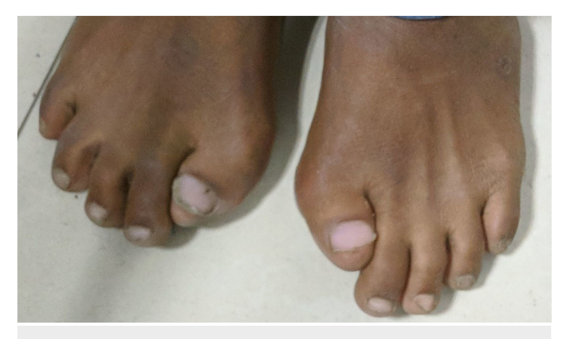
FIGURE 4: Clinical photograph of bilateral feet.

The hip movements were also severely restricted on both sides allowing just up to 60^{\circ} flexion causing restriction in sitting properly on a chair and inability to squat and sit cross-legged. Besides, there was a small, irregular, bony hard swelling palpable on the lateral aspect of the right distal thigh. On examination of the feet, there was hallux valgus present bilaterally along with microdactyly of the great toes (Figure 4).