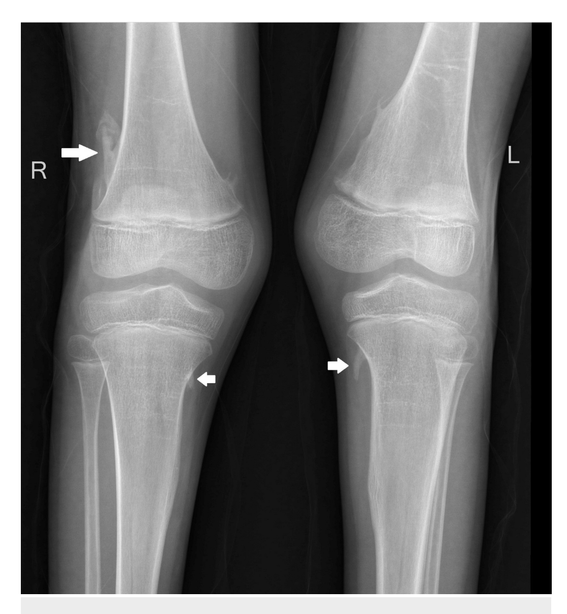
FIGURE 8: Plain radiograph of bilateral knees – anteroposterior view.

Bony outgrowth like appearance due to ossification along ligamentous insertion on right lateral distal femoral metaphysis as well as bilateral proximal medial tibial metaphyses producing pseudoexostoses (white arrows).