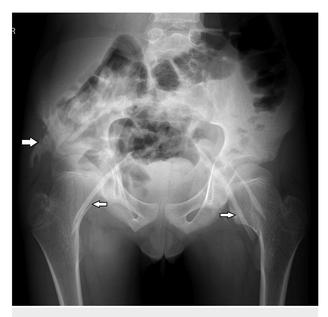
FIGURE 7: Plain radiograph of pelvis with bilateral hips – anteroposterior view.

Broadening of femoral neck with bridge like heterotopic ossifications extending across both the hip joints as well as lateral to the right iliac bone (white arrows).