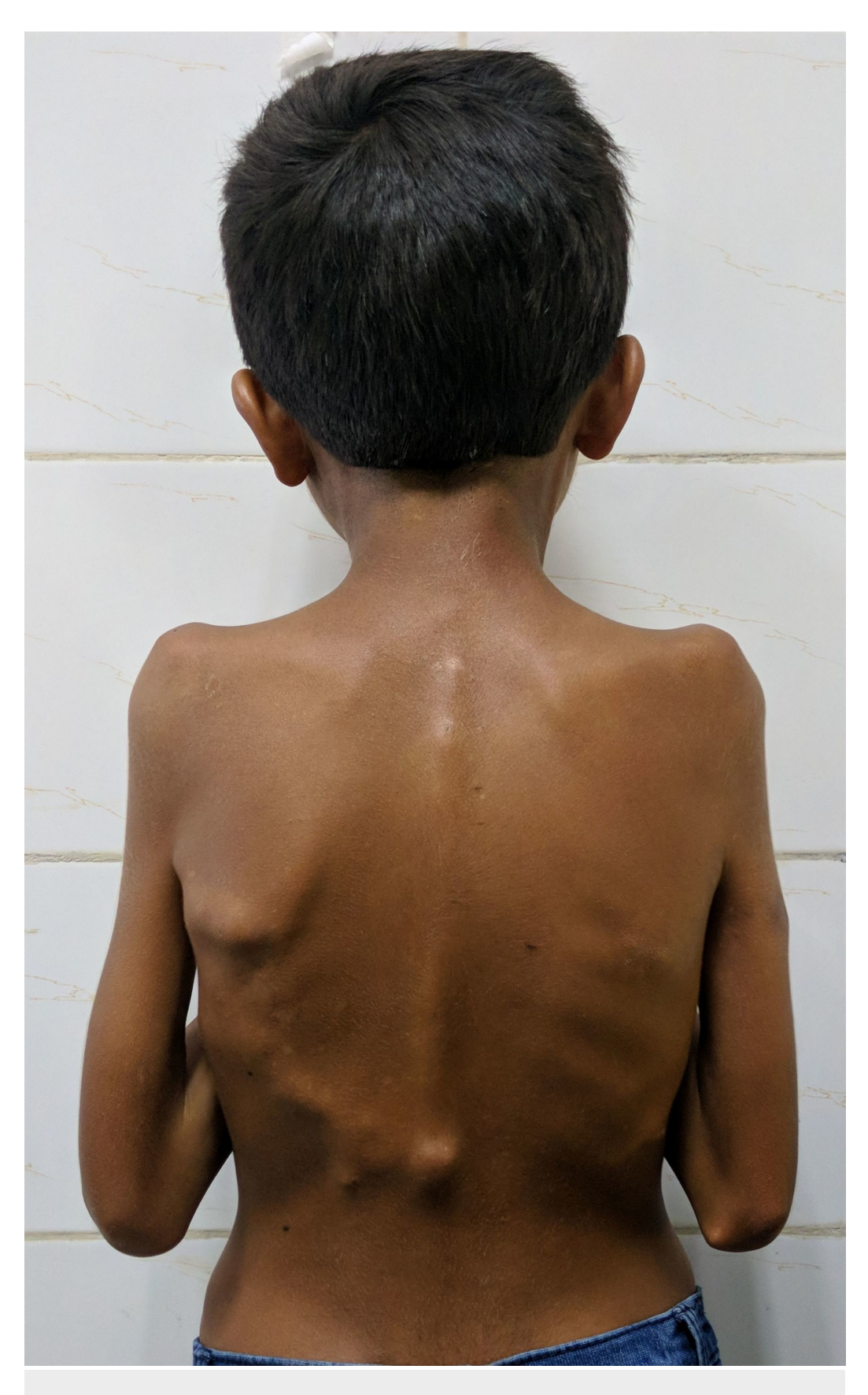
FIGURE 1: Clinical photograph of the back region.

Multiple small, irregular, non-tender, bony hard swellings were present over bilateral infrascapular regions extending up to the lower dorsal spine.