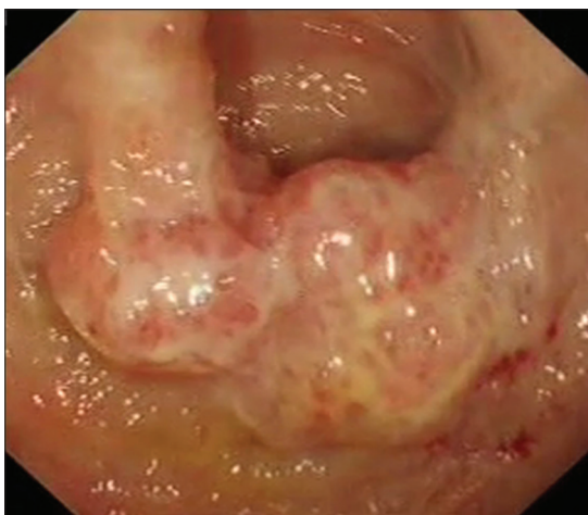
Figure 3. Peroral cholecystoscopic image of gallbladder carcinoma

diameter LAMS was placed to allow easy access of the endoscope into the gallbladder. [3] Spontaneous drainage of gallstones was observed in 56% of patients. Three