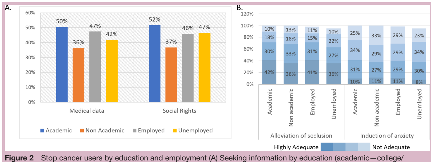
university; non-academic—high school) and employment status (B) Psychosocial impact—alleviation of seclusion versus induction of anxiety.

of treatment received. The social network had an allocated section for 'patient mentoring' of newly diagnosed members by survivors, which is an interesting addition to an online platform.