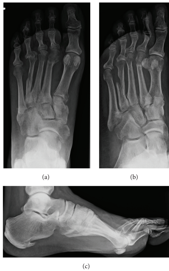
FIGURE 2: Preoperative dorsoplantar (a), oblique (b), and lateral (c) radiographs of the left foot showing malunion at fracture site, resulting in a lengthened fourth MT, and a dorsal dislocation at the fourth MTP joint.