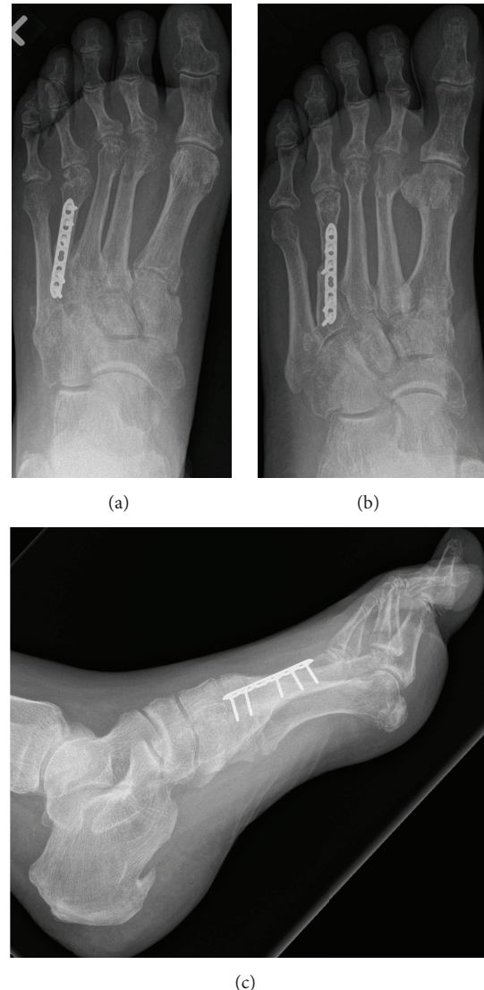
FIGURE 4: Final dorsoplantar (a), oblique (b), and lateral (c) radiographs showing fusion at fracture site, shortening of fourth MT, and maintained reduction at the fourth MTP joint.

MTP dislocations are often noted in 2nd toes in association with hallux valgus deformities, especially in patients with a long second MT relative to the 1st MT [6, 7]. In rheumatoid feet multiple claw toe deformities and associated MTP dislocations are common [8]. Irreducible traumatic MTP dislocations have been reported in various case reports. These are usually dorsal in direction and often a result of axial load applied to hyperextended toes [1–4]. Plantar dislocations are rare and usually due to dorsally directed force on the plantar aspect of metatarsal heads [9]. This paper presents a previously undescribed injury comprising both MT shaft fracture and MTP joint subluxation and ultimately dislocation of a lesser toe. Due to the initial displacement, the fracture partially healed, nonanatomically, with lengthening through the fracture site—effectively increasing the length of the 4th MT and thus disrupting the normal metatarsal parabola. Failure of early recognition and management of