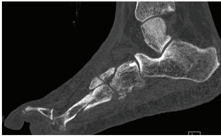
FIGURE 3: CT scan at the level of the left 4th toe illustrating fracture malunion and dorsal dislocation at the MTP joint.

the extensor tendons were mobilized, a dorsal capsulotomy was performed, and the collateral ligaments were released off the MT head. Even with that, a reduction of the dislocated joint was not possible. So at this point I decided to shorten the MT through the fracture site and secure it with a minifragment locking plate (Synthes, Mississauga, Ontario). A lag screw through the plate was utilized to secure the plantar fragment, which was sculptured to fit in. The 4th MTP joint was then reduced. The plantar plate was inspected and noted to be intact. The position of the reduced MTP joint was maintained with a 1.6 mm Kirschner wire. Layered closure of the incision was performed prior to immobilizing the foot in a cast boot. Three doses of antibiotics were administered postoperatively, and the patient was discharged home the following day. Stitches were taken out about three weeks later, and the pin was removed about 6 weeks postoperatively. Heel weight-bearing was allowed at 6 weeks and full-weight-bearing was allowed at 12 weeks. Patient did have delayed wound healing but made excellent recovery, and, at final follow-up eight months after surgery, his 4th MT was fully healed, 4th MTP joint maintained a reduced position, there was some evidence of disuse osteopenia but no evidence of avascular necrosis (AVN) of the MT head, and he was back to his preinjury level of activity (Figure 4).