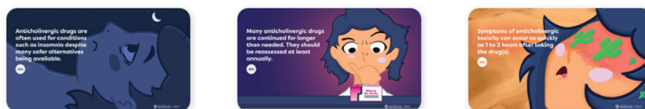
Figure 3. Anticholinergic Toxicity module flashcards.