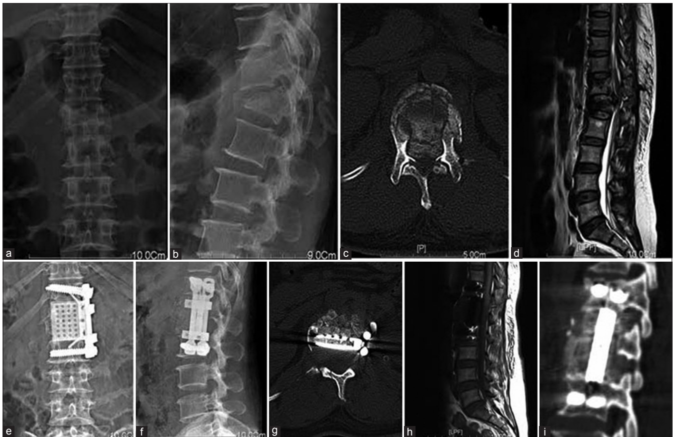
Figure 3: X-ray of dorsolumbar spine anteroposterior (a) and lateral (b) views showing an L1 burst fracture and kyphosis (c) Axial CT scan showing retropulsed fragment of L1 burst fracture (d) T2W mid sagittal MRI of dorsolumbar spine showing L1 burst fracture and spinal canal compression (e and f) X-ray anteroposterior and lateral views showing cage and implant in situ (g) Axial CT scan showing decompression and implant in situ (h) T1W mid sagittal MRI showing decompression (i) Reconstructed CT image at burst level showing adjacent vertebral bodies, cage and implant

bone implant inside the cage but also in front of the cage. In the current study, the amount of bone implantation in the burst vertebral body and adjacent disc spaces was larger. This was considered to be safe as the gate-like design could help avoid grafted bone dropping into spinal canal. Solid fusion was supposed to occur both inside and outside the rectangular cage, which would provide better fusion effect observed in the selective corpectomy.