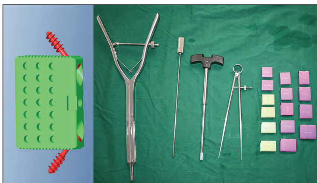
Figure 1: Photograph showing different sizes of U-cage for reconstructing fractured vertebral bodies along with instrumentation

All patients were placed right-side down to avoid retracting the liver and injuring the inferior vena cava. A retroperitoneal approach was used. The affected vertebra and two neighboring vertebrae were carefully exposed, and the segmental vessels of these three vertebrae were subsequently ligated. The intervertebral disk and cartilage above and below the injury level were removed while preserving the bony endplate. A slot on the posterior third of the vertebral body was made with an osteotome and hammer to decompress the spinal canal and create a space to place the U-cage, which eliminated the need to perform corpectomy [Figure 2]. A special distractor was used for reduction, and a gauge for measuring the length between the cephalad and caudal endplates was used to choose an appropriately sized U-cage. Cancellous bone harvested from the fractured vertebral body or resected ribs was packed inside the device. After confirming appropriate cage placement, two 3.5 mm cortical screws were fixed into the endplates to prevent further displacement and subsidence of the cage. Cancellous bone also filled into the space of the two intervertebral spaces and in front of the U-cage. Allogeneic cancellous bone was also applied if there was not enough bone for implantation. The low-profile anterior