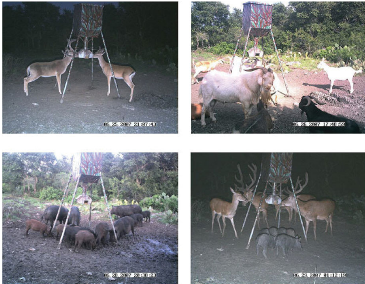
Fig. 2. [colour online]. Examples of livestock and wildlife use of a protein feeder in South Texas.

parts of the South and Midwestern United States [64]. This often controversial industry is thought by some to pose a risk for introducing and establishing additional foci of endemic wildlife diseases, including M. bovis [65]. In some locations, exotic hoofstock or native Cervidae are released or baited into a semi free-ranging environment for recreational hunting. There, the animals often mix with cattle and feral swine (Fig. 2), creating an environment for pathogen exchange [66]. Some livestock producers have boosted incomes by combining exotic and native hoofstock game ranching with traditional cattle production; others have replaced cattle with exotic or native hoofstock ranching as a new form of animal agriculture.