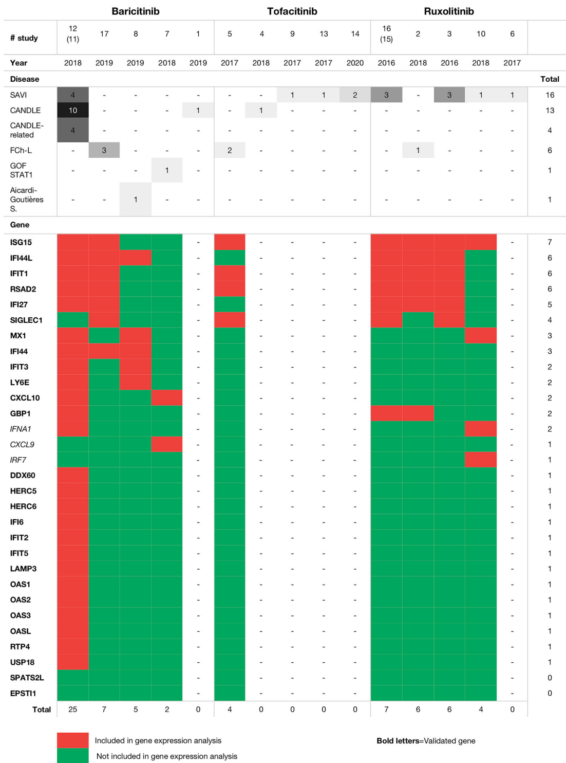
Fig. 2 Studies that have assessed the expression of interferon target genes as a tool to evaluate treatment response. See footnote to Table 1 for definitions of SAVI, CANDLE, FCh-L and GOF-STAT1