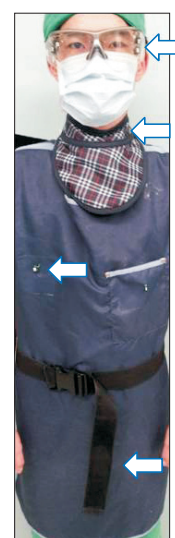
Fig. 2. Optically stimulated luminescence dosimeter was attached to in and outside of lead goggle, thyroid protector, chest and gonadal level of apron (arrow).