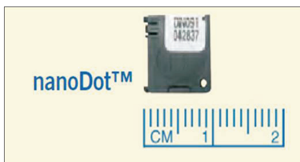
Fig. 1. In order to measure direct radiation exposure of vascular surgeon, optically stimulated luminescence dosimeter (InLight/OSL NanoDot dosimeter, Landau, Glenweek, IL, USA) was used.

In order to measure the direct radiation exposure of the operating vascular surgeon, an optically stimulated luminescence (OSL) dosimeter (InLight/OSL NanoDot dosimeter, Landau, Glenweek, IL, USA) was attached to the radiation protecting garments (Fig. 1). The low limit measurable dose of OSL was 100 μSv, the energy range was between 5 keV and 20 MeV, and the accuracy was ±5% standard. The OSL was attached on each inner and outer side of the lead goggle, thyroid protector, apron (breast level) and apron at the position of gonad being worn by the operator (Fig. 2). For detection of radiation exposure to scrub nurses who always stand next to the operator just slightly further from the C-arm, OSL was also placed on the outer and inner sides of the chest apron being worn by the scrub nurses who participated in vascular interventional procedures. Although the attending scrub nurse changed during the study period, nursing staff maintained the basic principle to always wear the same OSL attached lead apron. OSLs were never removed or used in a different position during study period and were sent to a reading institution after 6 months to analyze the dose information. The results from the reading were described as a dose. Effective dose of the surgeon was calculated in accordance to the equation of Niklason et al. [7].