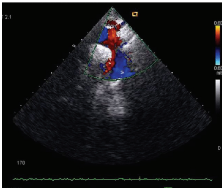
FIGURE 2: ECHO-Doppler study showing stenosis of the right subclavian artery.

3 years she presented with small and large joints arthritis, malar rash, discoid rash, oral ulcer, nonscarring alopecia, and photosensitivity (Figure 1). Peripheral pulses were not palpable over left brachial and radial artery, and blood pressure was 110/70 mm Hg in the right upper limb and both the lower limbs, not recordable in the left upper limb.