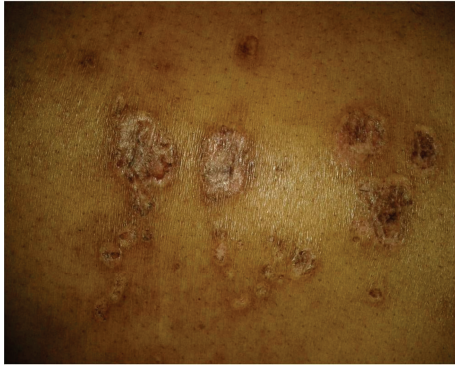
FIGURE 1: Discoid rash over the back.