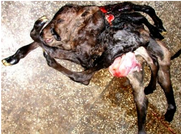
Fig. 1. Monocephalus Thoracopagus Tetrabrachius Tetrapus Dicaudatus Monster.

The thoraco-lumbar spine was evident but was not very clear as all the vertebrae were apparently smaller, compressed and distorted in shape. However, eight ribs were identifiable which converged at its spine which was found to be attached at a relatively ventral aspect of the thorax of the larger fetus.