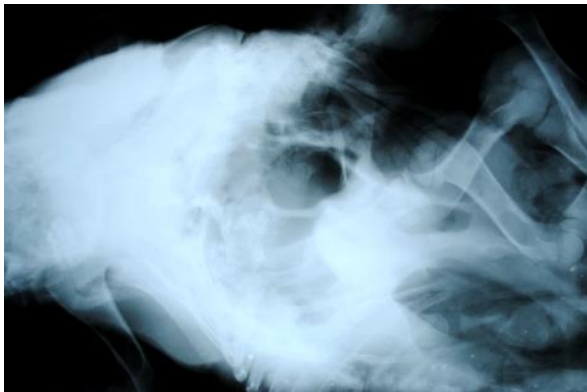
Fig. 2. Radiographic Projections showing forelimbs, thoraco-lumbar spine and hind limbs of larger fetus.