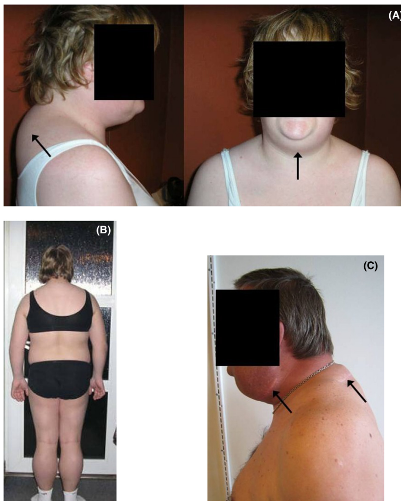
Figure 1. Photographs of the patients with the 8344A>G point mutation of mtDNA. The pictures show the proband aged 27 (A), her younger sister (age 17) (B), and her maternal uncle (age 52) (C). Black arrows indicate the presence of lipomas in A and C, and also the presence of scars in C.