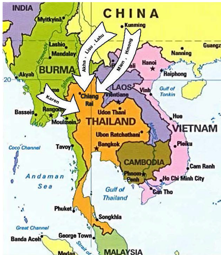
Fig. 1 Hill-tribe migratory map in Thailand. Mien and Hmong had the same migratory route from the south of China through the Republic of Laos to northern Thailand. Akha, Lahu and Lisu had the same migratory route from the south of China through the Republic of Laos to Northern Thailand. Karen had migrated into western region of Thailand. The figure is adapted from http://www.hilltribe.org/thai/museum/ . The figure's holder is The Mirror Foundation, Thailand, and has been premised to use by the director of The Mirror Foundation, Thailand

Chiang Rai Province, the northernmost province of Thailand, live in 652 villages with a total population of 180,214 persons [10]. Their villages are in remote areas approximately 70 km from the capital city with poor road access and public transport. Many Hill-tribe people do not qualify for or have failed to obtain a Thai identification card, which generally is required for free or subsidized government medical and educational services. Most of the Hill-tribe people, if working, work in manual jobs with low pay. The Hill-tribe people in northern Thailand therefore still have limited opportunity to earn money, receive health information, and have access to affordable healthcare. These populations are vulnerable to infectious diseases, such as HIV and TB.