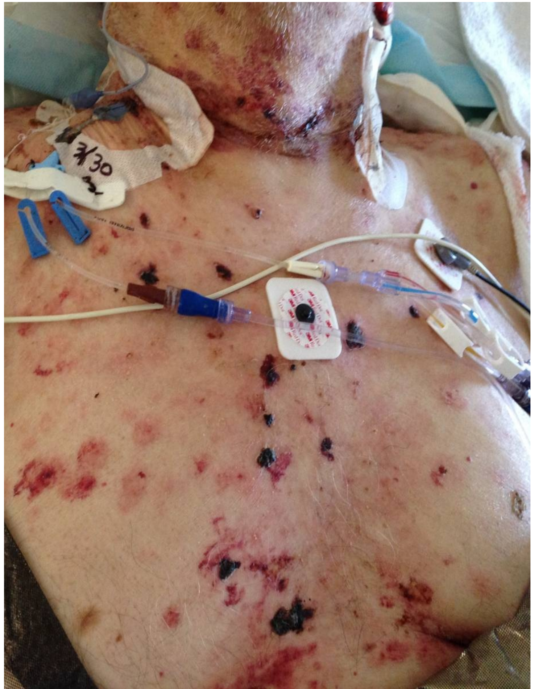
FIGURE 1: Chest lesions.

SJS-TEN was suspected and cefepime was discontinued immediately. Aztreonam and metronidazole were started instead. The rash continued to spread to his forehead, nose, oral mucosa, and chin (Figure 2).