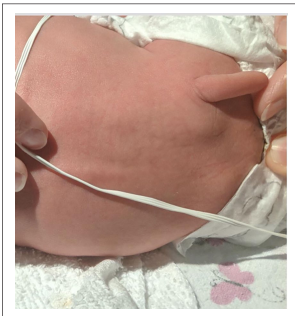
Figure 1. Caudal appendage lateral and 2.5 cm to the right of midline, measuring 3 cm \times 0.5 cm, with no apparent bony involvement. Image taken during newborn hospital stay.

Pediatrics subspecialties including genetics, orthopedics, neurosurgery, general surgery, and plastic surgery were consulted during the NICU hospitalization. Genetics recommended obtaining a chromosomal microarray and outpatient follow-up. The surgical subspecialists recommended no acute interventions and outpatient follow-up. The remainder of the patient's 6-day hospitalization was unremarkable. She had jaundice but did not require phototherapy. She fed well and was near birth weight at the time of discharge.