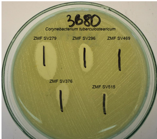
Fig. 2 Results of BLIS active against Corynebacterium tuberculo-stearicum 3B80 isolated from healthy human skin detection (5 SDSE human isolates)

its current position in the evolutionary outline published by Wolfe et al. [8] is not certain because of insufficient data. The horizontal transfer of virulence genes between SDSE strains and from S. pyogenes to SDSE strains has already been reported [11, 28]. Animal SDSE strains might asymptotically transfer to human skin, acquire virulence genes from human streptococci, and develop full infection in favorable conditions, i.e., skin damage or immunological system impairment. The risk of zoonotic infection is the most significant in people having regular contact with animals, such as veterinarians, cattlemen, and farmers. SDSE is also prevalent on a skin of healthy