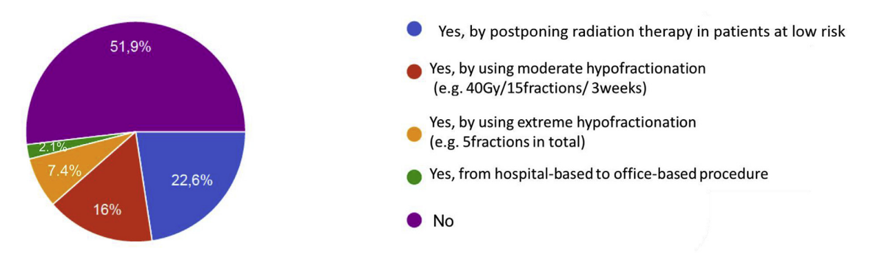
Fig. 2. Changes in radiation therapy schedules.

situations and call for consensual evidence-based guidelines. As of now, various recommendations have been published [12–16,20,21,23]. However, these recommendations derive mostly from opinions of expert panels and cannot rely on solid data due to the novelty of SARS-CoV-2 and COVID-19.