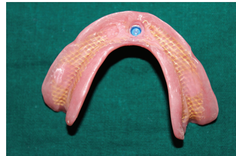
FIGURE 3: Female housing picked up in the denture.

One root form implant (3.8 × 9.5 Myriad Implant System, Equinox Medical Technologies B.V., Netherlands) was placed into the parasymphyseal region of mandibular alveolar bone perpendicular to occlusal plane, after anaesthetizing the region with the local anesthetic agent (Lignospan Special, 2% lidocaine with 1 : 80,000 epinephrine, Septodont, France), and a mid crestal incision was made with relieving incision and the mucosa was reflected and the selected implant was placed after preparing the osteotomy as prescribed by the manufacturer. The implant achieved an insertion torque of 35 Ncm. The reflected flap was later sutured using vicryl (absorbable, polyglactin 910) suture. A postoperative radiograph was taken to confirm the position of the implant placement (Figure 1). Postoperative care instructions were given to the patient and medications were prescribed (Amoxicillin 500 mg TDS, Tinidazole 500 mg BD, and Ibuprofen 200 mg TDS for 5 days). After a week from the surgery, the surgical site was evaluated for any infection and discharge and when it was found that the healing was appropriate and the sutures were removed. The implant was allowed to heal for 6 weeks.