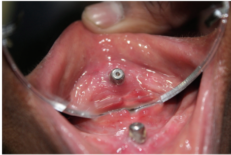
FIGURE 1: Healing after 6 weeks.