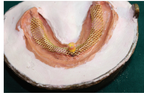
FIGURE 2: Metal mesh adapted on the master cast.