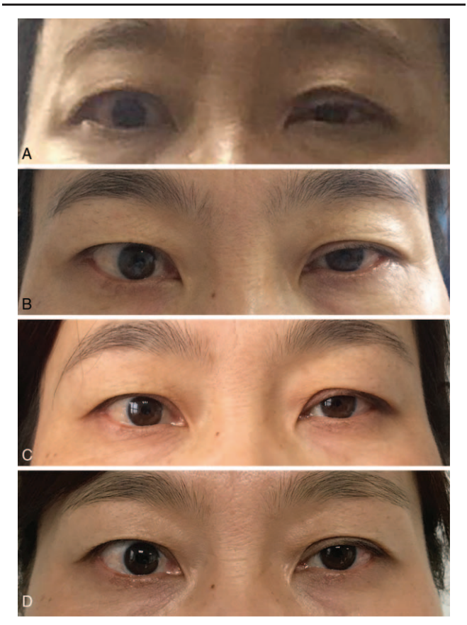
Figure 2. Patient with Horner syndrome. (A) Two days postoperative. (B) One month postoperative. (C) Six months postoperative. (D) One year postoperative.

revealed left papillary thyroid microcarcinoma (Fig. 1) and lymph node negativity for all nodes. On postoperative day 2, left myosis, eyelid ptosis, and mild enophthalmos developed (Fig. 2), without anhidrosis or vascular dilatation of the face. No other complications, such as bleeding, wound infection, vocal cord palsy, or hypoparathyroidism developed. On postoperative day 3, the patient was administered glucocorticoids (intravenous infusion of 10 mg dexamethasone once a day for 3 days) and neurotrophic drugs (intravenous infusion of 0.5 mg mecobalamin once a day for 7 days). After 1 year of follow-up, she showed a significant improvement in ptosis and myosis (Fig. 2), her thyrotoxicosis disappeared, and laboratory examinations were