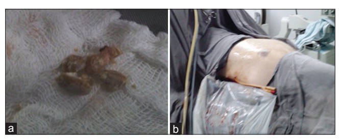
Figure 4: (a) Retrieved stones (b) Final aspect