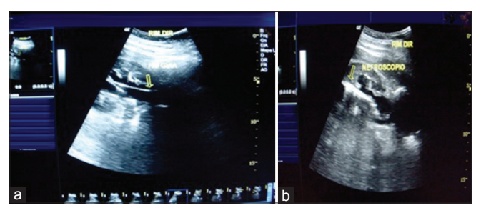
Figure 3: (a and b) Percutaneous nephrolithotomy was performed with ultrasound guidance (without fluoroscopy) and in a supine position

imaging method in pregnancy, and several measures have been recommended to enhance its performance (Pelvic diameter, Color Doppler imaging, Resistive index, Ureteric jets).<sup>[1,5]</sup>