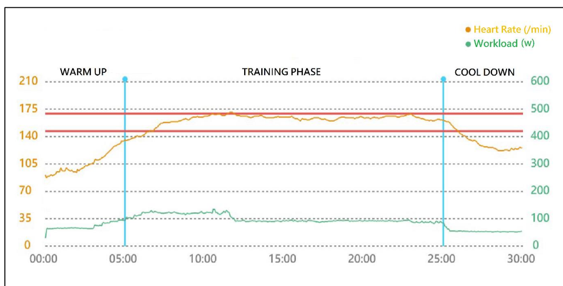
Figure 1. Demonstration of a training-intensity adherence diagram generated by the ICTS. The 2 horizontal red lines indicate the 60% and 80% HRR (147 and 170 bpm, respectively) of this participant according to a predetermined target HR. During the 20 min training phase, the HR was kept within the target range 91.1% of the time.

After training, workload–time and HR–time were plotted. Based on this, we devised an indicator of adherence: the percentage of time within the target HR range (i.e., %time) during the 20 min training phase (Figure 1).