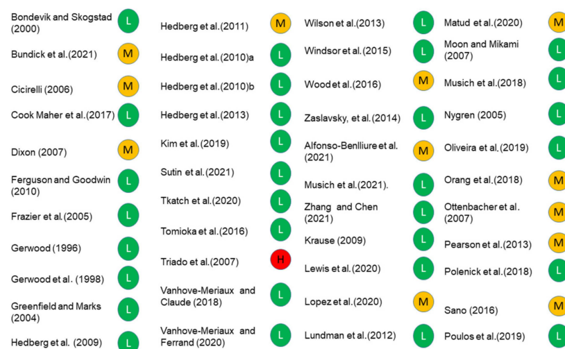
Figure 3. RoB of included studies.

Of the 34 studies that reported determinants of PIL, six reported sociodemographic determinants. Age, gender, education, income, ethnicity and marital status were associated with PIL (Table 3). Two studies [77,80] reported older age groups to have better PIL while Triado et al. [47] reported a disagreement where younger age was associated with PIL. Three studies showed an association of female gender with PIL [56,77,80]. Four studies showed higher education to be associated with PIL [47,59,62,80]. Two studies each reported association of marital status (being married) [62,80], income [47,62] and ethnicity [77,80] with PIL. While Zhang and Chen [80] reported an association of PIL with ethnicity (being white/Caucasian), Bundick et al. [77] showed an association with being white. All, except Triado et al. [47], scored low-moderate risk of bias (Figure 3). Overall, the evidence suggests female gender, marital status (married) higher education, and income are determinants of PIL.