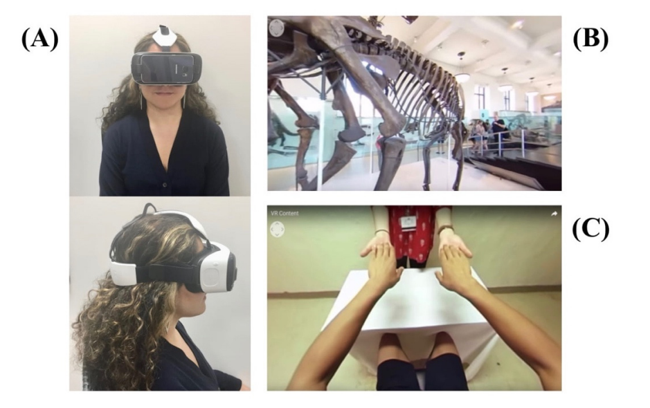
Figure 1. Virtual reality setup for the somatic and scenery virtual environments. ( A ) Samsung Gear virtual reality headset frontal (top) and side view. ( B ) Scenery virtual environment: participants are shown scenes that do not involve somatic interaction with the painful limb (in this case a scene taken from the Museum of Natural History). ( C ) Somatic virtual environment: participants are shown scenes that involve functional movements of the upper and lower limbs. Written informed consent was obtained from the individual for the publication of this image.

and somatic, where the VE consisted of upper and lower extremity movements (Figure 1). Two types of somatic environments were used, and participants chose the most appropriate environment based upon their self-reported location of their most prominent pain: an upper extremity VE or a lower extremity VE. While viewing the VEs, no specific commands were given, and participants were not encouraged to focus on any particular part or element of the VE. Patients underwent the two consecutive VR sessions (scenery and somatic) in a randomized order. Each VR session was 10 min in duration. The participant was permitted to leave the laboratory and move freely within the campus (in some cases for several hours) and return for the second VR session once the participant reported a return to baseline pain level.