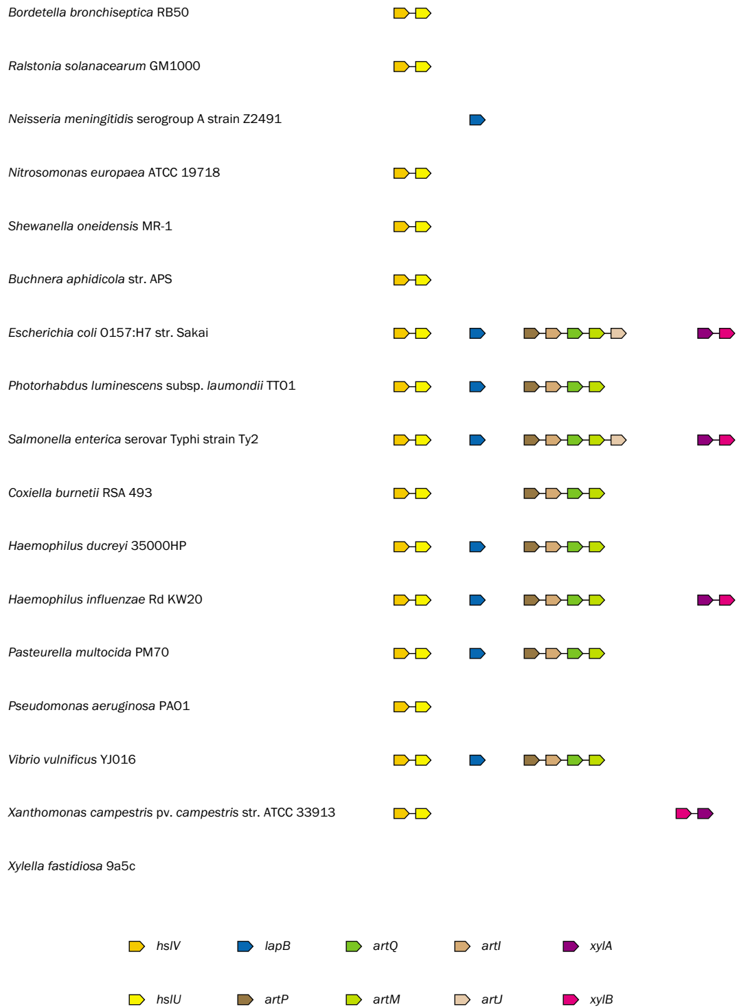
Figure 2 Conserved gene strings in 17 prokaryotic genomes analyzed in this study. For each protein searches were performed at the STRING server [57] with a high confidence score > 0.7. Colored arrows indicate orthology. Gene names are those reported in protein databases.