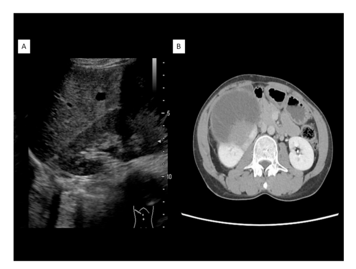
Fig. 1. Results of preoperative imaging studies. (A) Transabdominal ultrasonography showed a cystic mass in the right kidney. (B) Contrast-enhanced computed tomography showed a 12 \times 8 -cm cystic right renal mass with enhanced cystic wall and solid portion.