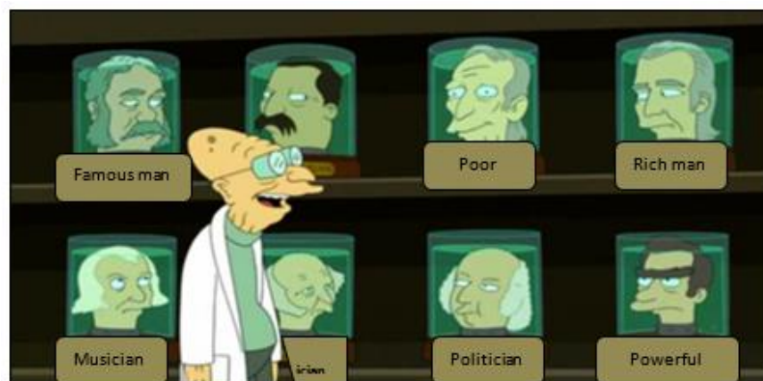
Fig. 2: Prioritize the head transplant (11)