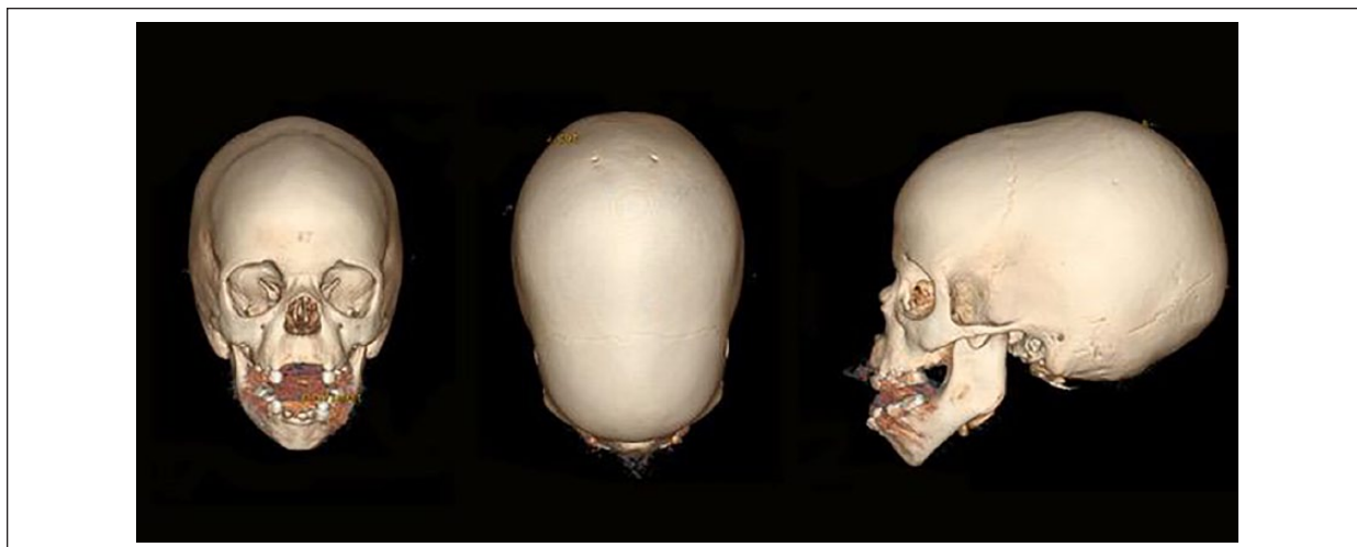
Figure 1. Three-dimensional computed tomography scan (patient 2) demonstrating coronal, axial, and sagittal views of patient with isolated sagittal synostosis and associated scaphocephaly.

abnormalities, and dysmorphic appearance. The mechanism of Ras dysfunction begins with the disruption of the intrinsic GTPase activity of the Ras protein, which causes excessive Ras signaling. This may lead to exaggerated cell growth and even cancer. 1 The aim of this article is to further characterize the association between ISS and RASopathy, as demonstrated in 5 patients seen at a single institution. IRB approval was obtained before acquisition of patient information. Informed consent was obtained for the use of patient photographs.