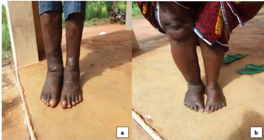
Fig. 2: Aguibege participants with lymphoedema on both legs (a) a man (b) a woman