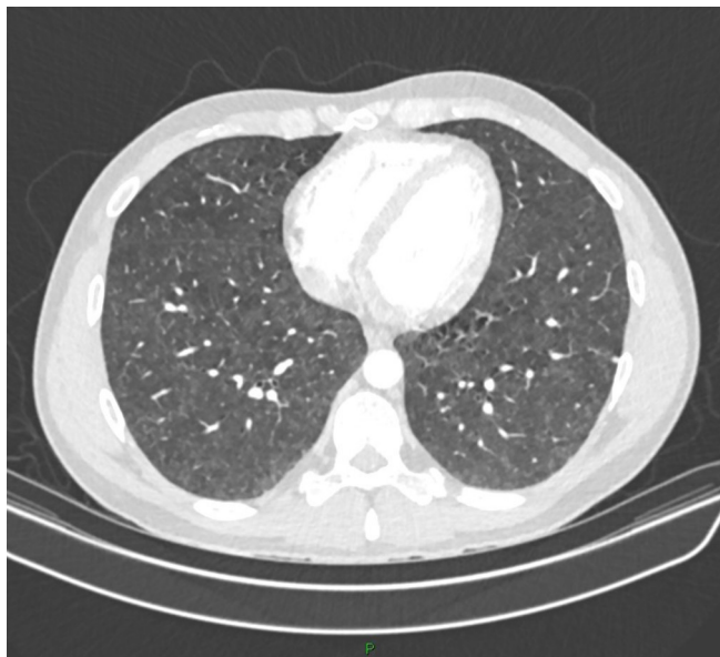
Figure 1 Initial CT pulmonary angiogram demonstrating ground-glass nodularity.

remission). Given the atypical nature of the case, he was discussed at the IBD multidisciplinary team meeting. The consensus of the meeting was that once infection (especially pulmonary tuberculosis) had been more robustly excluded at bronchoscopy (results below), an empirical trial of infliximab should be undertaken. The patient preferred not to have transbronchial lung biopsy (or indeed formal lung biopsy) performed because of the perceived risk of these interventions. Given there were still no bowel-related symptoms colonoscopic investigation was not undertaken.