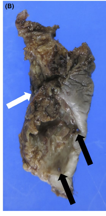
FIGURE 1 Macroscopic findings of the primary rectal fistula (A: black circle), secondary perianal fistula (B: white circle), and fistula tract (C: gray circle)

This is an open access article under the terms of the Creative Commons Attribution-NonCommercial License, which permits use, distribution and reproduction in any medium, provided the original work is properly cited and is not used for commercial purposes. © 2021 The Authors. Clinical Case Reports published by John Wiley & Sons Ltd.