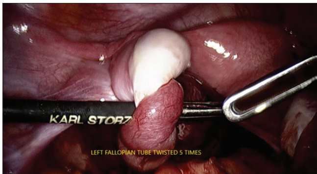
Figure 1: Twisted left fallopian tube

There are several hundred cases of Fallopian tube torsion mentioned in medical literature till date. The exact physiology and mechanism of fallopian tube torsion are unknown. Tubal torsion is more common on the right side, possibly because of the presence of the sigmoid mesentery on the left side, preventing the free mobilization of the tube and because right lower quadrant pain is more often surgically explored suspecting appendicitis. [5] There are various intrinsic and extrinsic risk factors that could cause this event, such as pelvic inflammatory disease, hydrosalpinx, tubal neoplasm, and extrinsic risk factors such as adhesions, adjacent ovarian, and paraovarian masses, uterine masses, gravid uterus, and trauma. [6] In our case, the main risk factors were ruled out, suggesting the possibility of a congenital long Fallopian tube or hydrosalpinx due to pelvic inflammatory disease. The authors mean to say that the patient