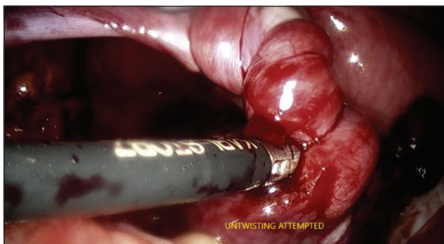
Figure 3: Untwisting of the left fallopian tube