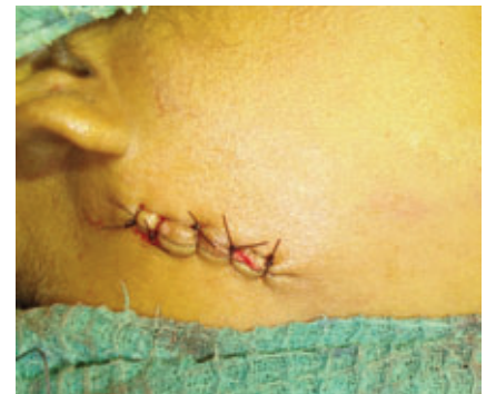
Figure 6. Closure.