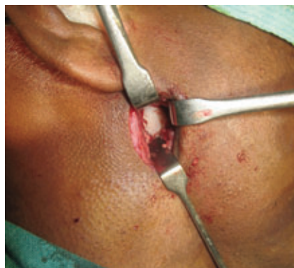
Figure 3. Hinds incision.