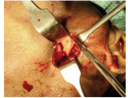
Figure 4. Fracture site.