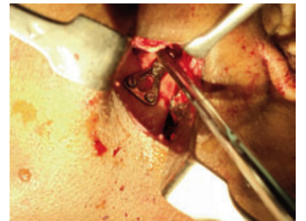
Figure 5. Fracture reduction.