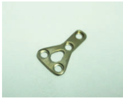
Figure 1. Delta plate.

Out of nine cases five patients were put in postoperative intermaxillary fixation for a period of one to two weeks. Restoration of