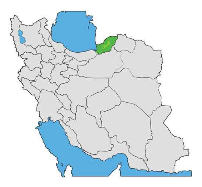
Fig. 1: Location of Golestan Province in Iran, showed in green color

This descriptive cross-sectional study was conducted from Feb to Jun 2017 in Gorgan City, capital of Golestan Province, Southeastern the Caspian Sea, north of Iran (Fig. 1).