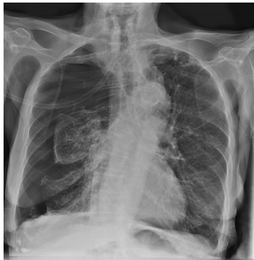
FIGURE 1 Chest radiograph on admission.

A 93-year-old female presented to the emergency department with a short history of exertional dyspnoea and right-sided shoulder pain. She was found to be hypoxic on room air. She was an ex-smoker and had a history of well controlled COPD. Despite her age she remained independent in activities of daily living, without history of functional or cognitive impairment. She had a past medical history of macular degeneration, transient ischaemic attack (2007), subarachnoid haemorrhage (1985) and hypertension. Her drug history was of clopidogrel 75 mg daily only. Clinical examination revealed hyper-resonant percussion note, reduced air entry and decreased vocal resonance on the right. Initially recorded resting oxygen saturations were 96% on 4 L · min -1 oxygen via nasal cannulae, heart rate was 96 beats · min -1 and blood pressure 151/63 mmHg. A chest radiograph was performed.