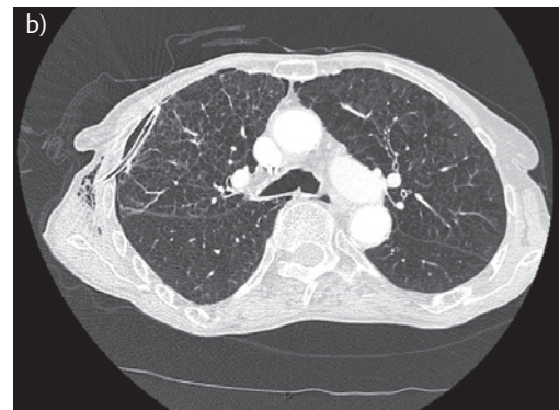
FIGURE 2 Chest CT (two slices). a) Transverse section of the lung apices, b) transverse section at the level of the carina.