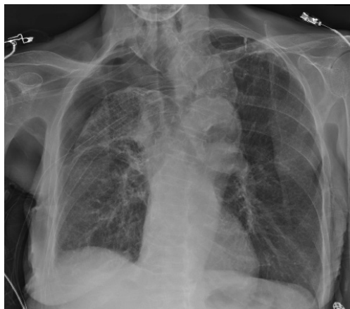
FIGURE 3 Post-procedure chest radiograph.

Temporary occlusion of the right upper lobe sub-segmental bronchi with a balloon catheter