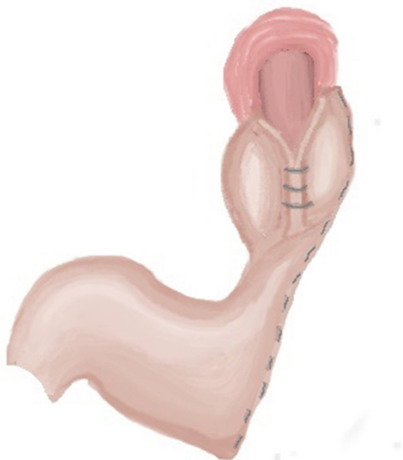
Figure 2 Technical aspects of the N-Sleeve. N-Sleeve, Nissen-Sleeve.