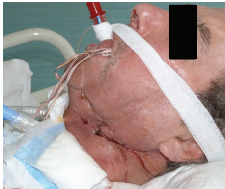
FIGURE 2: King LT-D tube in place acting as a pharyngeal compression device. Patient is ventilated through a tracheostomy.

allow intraluminal compression with definitive cessation of bleeding after 36 hours.