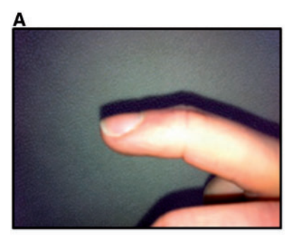
Fig. 1 Custom thermoplastic gutter splinting of the DIP joint