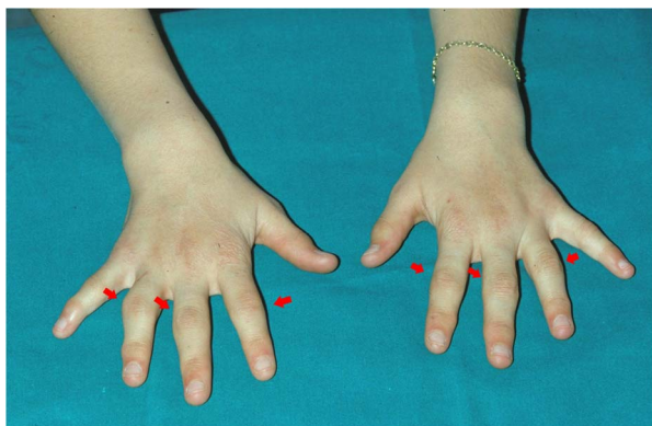
Figure 2 Camptodactyly in a young patient affected with BS.

Joint involvement can be complicated by deformities; in particular, in acute phases, involvement of the hand small joints is often hypertrophic and associated with tenosynovial cysts (“boggy” synovitis and tenosynovitis)