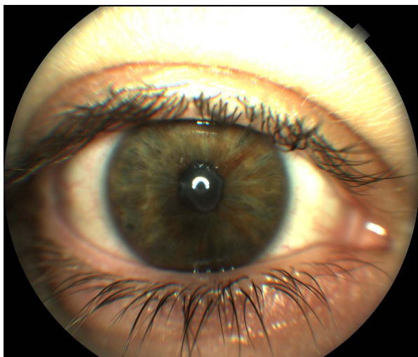
Figure 3 Anterior uveitis in a patient with BS showing fibrin at the level of the anterior chamber.

glaucoma, peripheral synechiae, increased intraocular pressure and optic atrophy can represent uveitis complications. 23–29 Figure 3 shows an acute flare of anterior uveitis in a patient with BS.