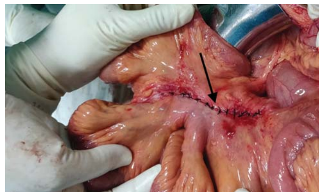
Fig. 4 The mesenteric defect closed with interrupted 3-0 silk sutures.

Although transmesenteric hernias were previously uncommon, a rise in Roux-en-Y bypass and liver transplant surgeries have led to an increase in their incidence. In the pediatric population, these defects are commonly congenital and in the region of the small bowel (70% of cases), with 53% of these being in the ileocecal area of the mesentery. 2 This area was originally described by Treves in 1885. He noted an area of the mesentery (later named the Treves' Field) circumscribed by the last ileal branch and the ileocolic artery that contained no fat, no lymph nodes, and no visible vessels rendering it highly susceptible to injury during development. 3 Other possible etiologies of a mesenteric defect include intraperitoneal inflammation, trauma, partial developmental regression, and fenestration of the mesentery by the colon during embryologic displacement into the umbilical cord. 1