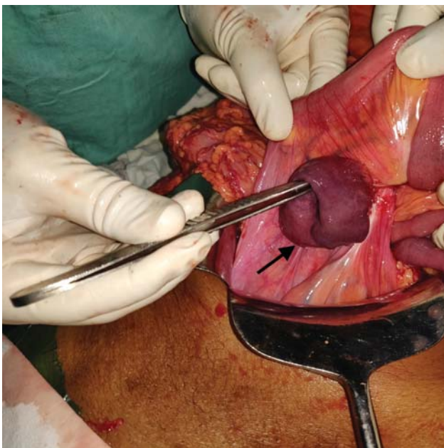
Fig. 2 A transmesenteric hernia with dusky small bowel loop herniating through the defect. The black arrow shows the mesenteric defect with a dusky terminal ileal loop herniating through it.

Internal hernias, defined as a protrusion of viscus through an intra-abdominal aperture without traversing fascial planes, are a rare cause of intestinal obstructions. These consist of paraduodenal (53%), pericecal (13%), foramen of Winslow