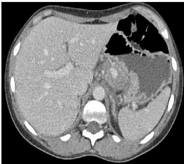
Figure 1 Contrast enhanced CT-scan showing left gastric artery pseudoaneurysm.

associated with left sided pleural effusion. An Endoscopic Ultrasound (EUS) confirmed the findings and cyst was aspirated to dryness. Cyst fluid biochemistry showed high amylase levels (18088 u/l) thus confirming the lesion to be a pancreatic pseudocyst. After initial resolutions of symptoms following cyst aspiration she became symptomatic again within a few days and therefore a surgical cystogastrostomy was performed. Post-operative recovery was uneventful and a follow-up CT scan 3 months after surgery showed completed resolution of the cyst.