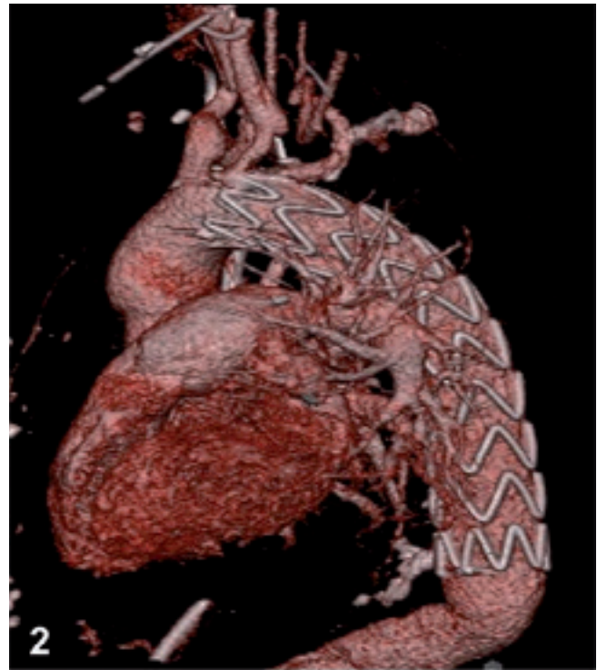
Figure 2. Three-dimensional reconstructed CT scan after thoracic endovascular stent graft implantation.

Ten months after the last admission, the patient experienced a persistent high-grade fever. A blood test revealed an elevated leukocyte count and highly elevated C-reactive protein level. CT revealed air around the stent grafts, suggesting infection (Figure 3). After being informed that any