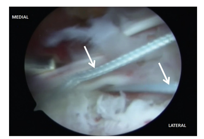
Fig 2. With arthroscopic visualization of this right shoulder through the posterior portal, the superior aspect of the glenoid is prepared using a combination of a radiofrequency wand and high-speed osseous burr. Following this, 2 3.0-mm SutureTak anchors (white arrows) are used, one placed at the 10 o'clock and the other at the 2 o'clock position using the Neviaser portal. Following this, the sutures are retrieved.

In preparation of additional anchors to be inserted, the superior glenoid is then prepared with an arthroscopic burr (Smith and Nephew) to get a bleeding surface. The capsule is repaired to the most medial aspect of the joint