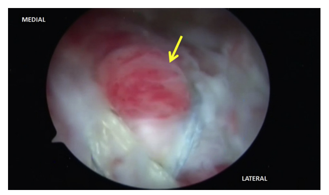
Fig 6. Arthroscopic visualization of the graft used to perform the superior capsule reconstruction and the subsequent superimposition of the rotator cuff atop the graft (yellow arrow) in the right shoulder are shown through a 30° arthroscope inserted in the posterior portal. Ultimately, this reconstruction helps restore the correct position of the humeral head and decrease the acromiohumeral distance.

All instruments are withdrawn from the shoulder. The wounds are closed with 3-0 Monocryl followed by Dermabond, Steri-Strips, plains, ABD, and Medipore dressing. The patient is placed in a padded ABD sling. The advantages and disadvantages associated with the described technique are listed in Tables 1, and pearls and pitfalls are shown in Tables 2.