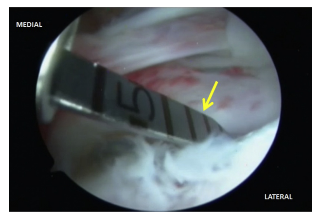
Fig 3. Once the 2 anchors are inserted on the superior aspect of the glenoid and the correct position is confirmed using a 30° arthroscope through the posterior portal, a sizing device (yellow arrow) is used to measure the correct size for the graft to be inserted in the right shoulder through use of anterior to posterior and medial to lateral measurements.

using 2 4.75-mm SwiveLock anchors (Arthrex) and FiberTape suture (Arthrex). To place the SwiveLock anchor (Arthrex), a 4.0-mm drill (Arthrex) is used to make a tunnel where the anchors will be placed. If the bone quality is good, it may be necessary to use a tap before inserting the Swivelock (Arthrex). The FiberTape suture (Arthrex) is passed through the dermal patch and then through the SwiveLock, and a horizontal stitch is tied.