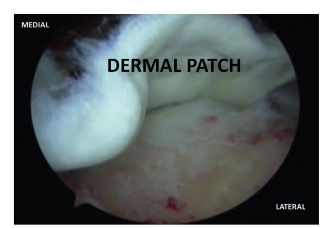
Fig 4. Using the sutures previously retrieved from the right shoulder while visualizing the joint through use of the arthroscope in the posterior portal, the dermal patch that was previously prepared in the back table using the intra-articular measurements is brought to the superior aspect of the glenoid in this right shoulder using a tension slide technique.

The greater tuberosity is then prepared anteriorly, middle, and posteriorly, using a burr and a radio-frequency burr (Fig 5). The rotator cuff is mobilized and pulled laterally. To ensure a complete mobilization of the rotator cuff, anterior and posterior releases of all the