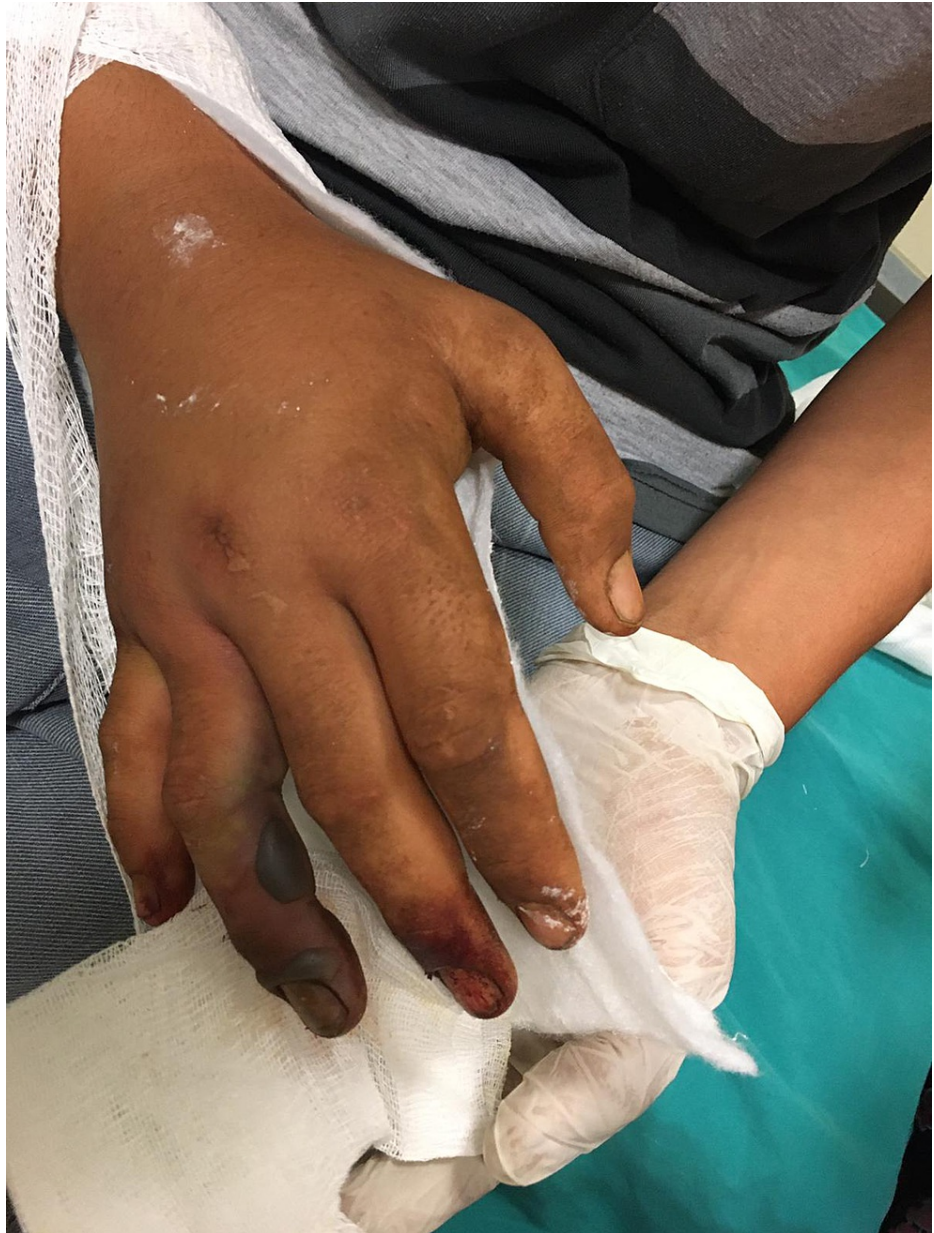
FIGURE 3: Necrosis and bullae developed in the distal phalanx of patient 22.