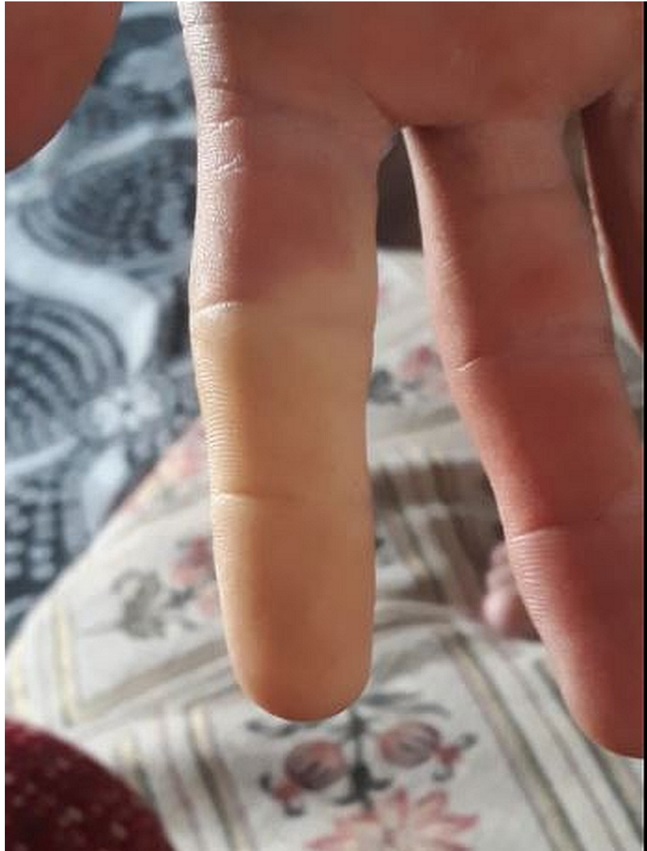
FIGURE 7: A patient who developed complex regional pain syndrome after exposure to cold air 6 months after the snakebite.