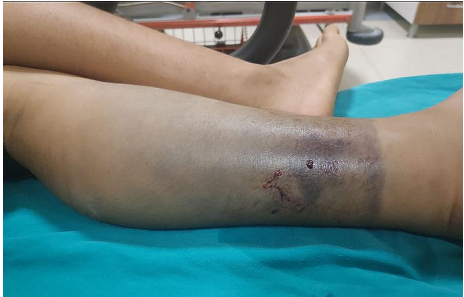
FIGURE 5: A patient who was bitten on the leg showed widespread swelling and ecchymosis on the leg.