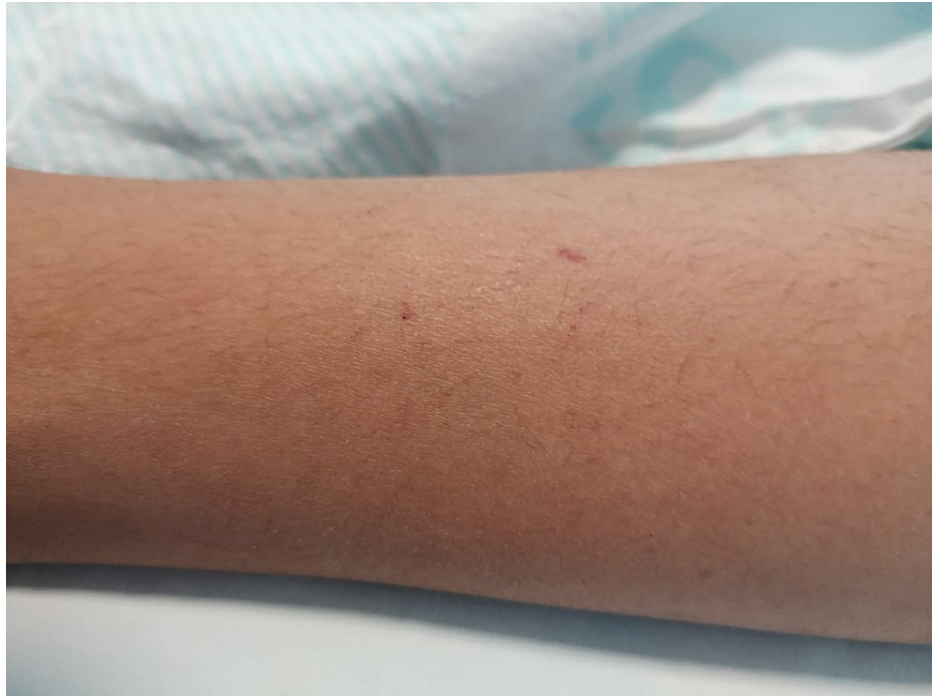
FIGURE 2: Dry bite and tooth marks in a snakebite patient.