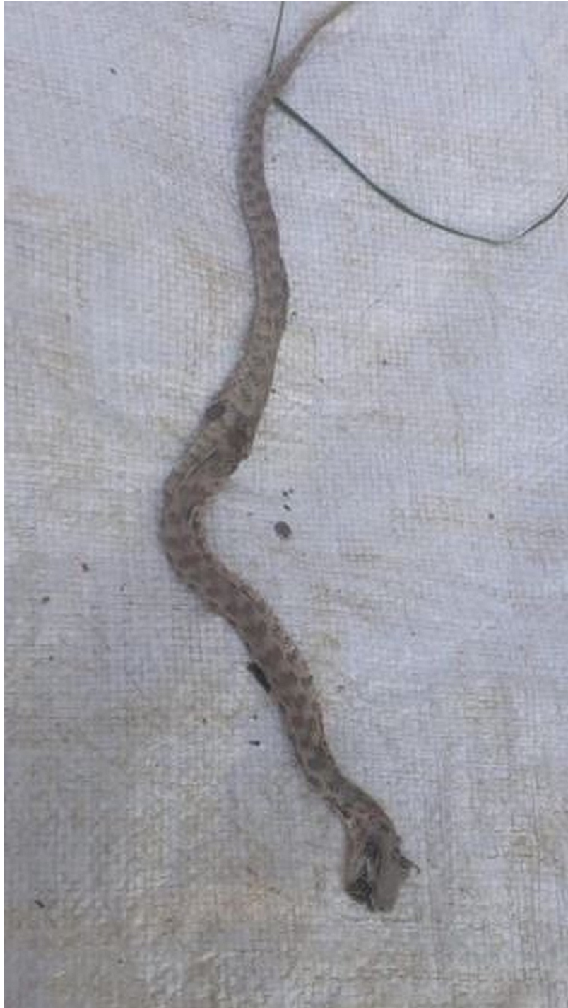
FIGURE 4: The viper snake killed by the relatives of patient 22.