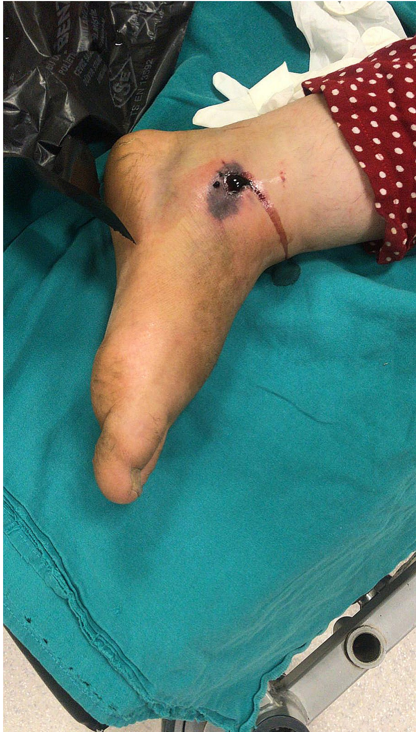
FIGURE 6: A patient who was bitten on the leg showed necrosis and bullae.

Among our patients, compartment syndrome developed in patient 14, who was bitten on the finger in July, but fasciotomy was not performed. He received 14 vials of antivenom, his hand healed, and he was discharged. However, after six months, extreme pain and pallor developed in his finger after exposure to cold weather in January (Figure 7). The patient was diagnosed with complex regional pain syndrome.