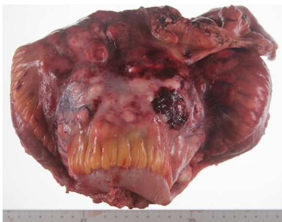
Fig. 2. Specimens from a partial intestinal resection. Normal intestine which was invaded by the tumor was perforated. The size was 14 × 13 × 20 cm. the tumor was soft, white and had myxoid change. The site of perforation was very small, but fibrins and clots attached around it.

resected specimen showed normal intestine which was invaded by the tumor was perforated. The tumor was soft, white and had myxoid change (Fig. 2). His postoperative clinical course was uneventful and discharged 10 days postoperatively. The pathological findings showed spindle shaped. The perforated site was invaded by tumor and the pathological findings at the perforated site showed it invaded the mucosa. Immunohistochemical spectrum resulted c-kit negative, DOG-1 negative, CD34 negative, S-100 negative, desmin positive, alpha smooth muscle actin( \alpha SMA) positive and Ki-67 30–40% (Fig. 3). We diagnosed intestinal leiomyosarcoma.