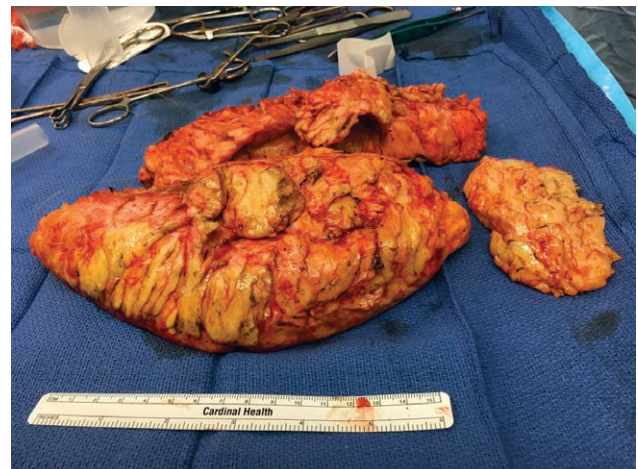
Fig. 3. A total of 2–3 L of tissue were removed from bilateral glutei.